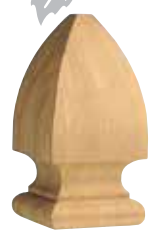
Spire 48/Box Comes without screw