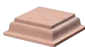
Colonial Post Cap 4 1/2" x 4 1/2"