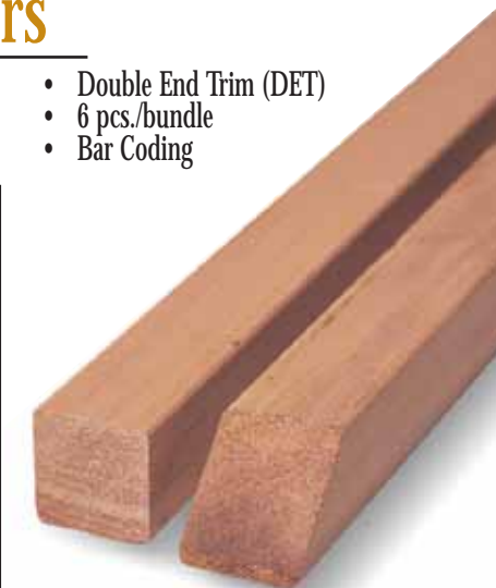
Square End Mitred 1/4" Blunt Tip