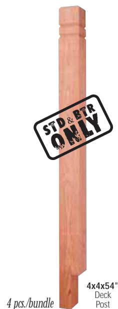
4 pcs./bundle 4x4x54" Deck Post