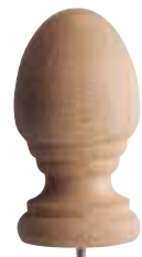
Large Acorn 48/Box