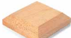
Post Cap 5 1/4" x 5 1/4"